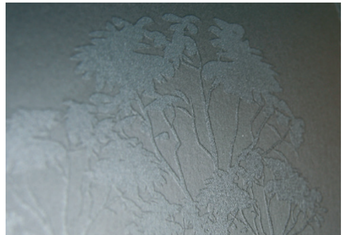
The effect of partial varnishing can make the product more attractive