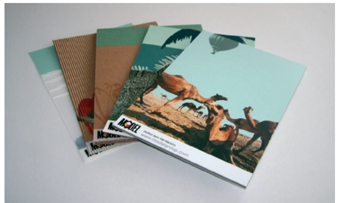
Some of the printing from the sample book, which is used by sales representatives of Model Obaly