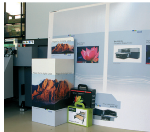
Versatile corrugated packaging and display production