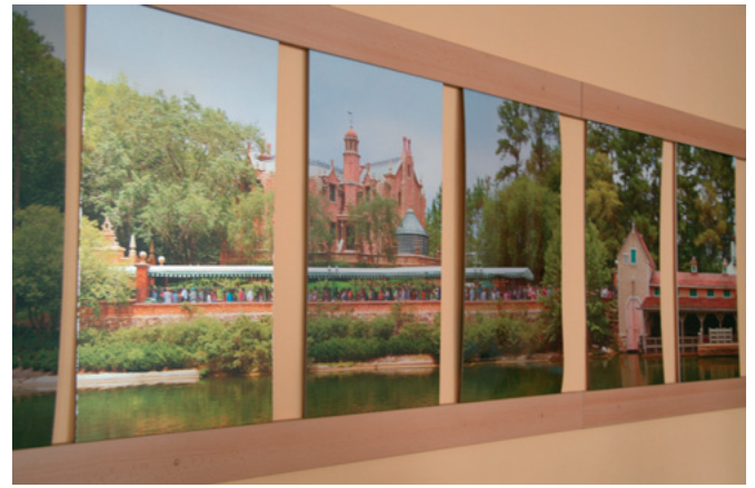
The possibilities of UV technology are also illustrated on this noticeboard