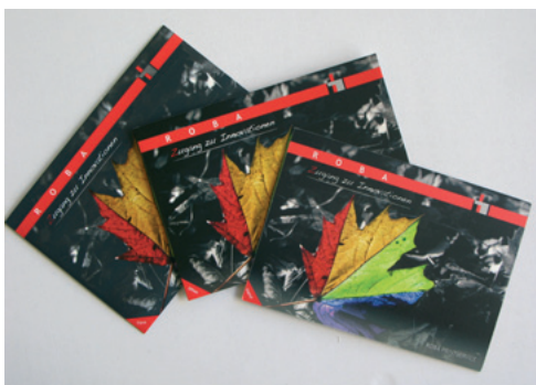
A winning hand. ROBA offers full print service with flexo, offset, and digital print

The visitors could see how blank sheets were printed with the Rho and converted into boxes and displays with the Kongsberg cutter. The graphics varied according to the corporate design colours of ROBA, ESKO, and Durst. By that the full versatility of the digital production workflow could be experienced.