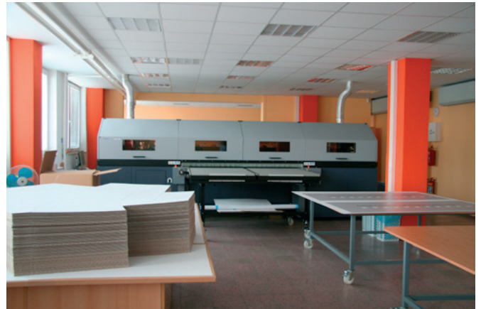
Durst Rho 700 Presto installed in premises of Model Obaly.

Model Obaly managed to fulfill its ambition of launching a short run production of point of sale displays